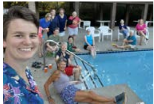
Women's Night Out